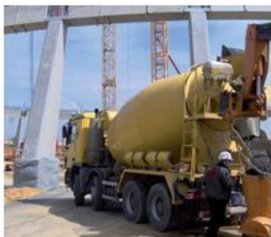
RMC Trucks and Batching Plants