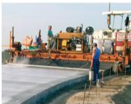
Pavers and Finishers